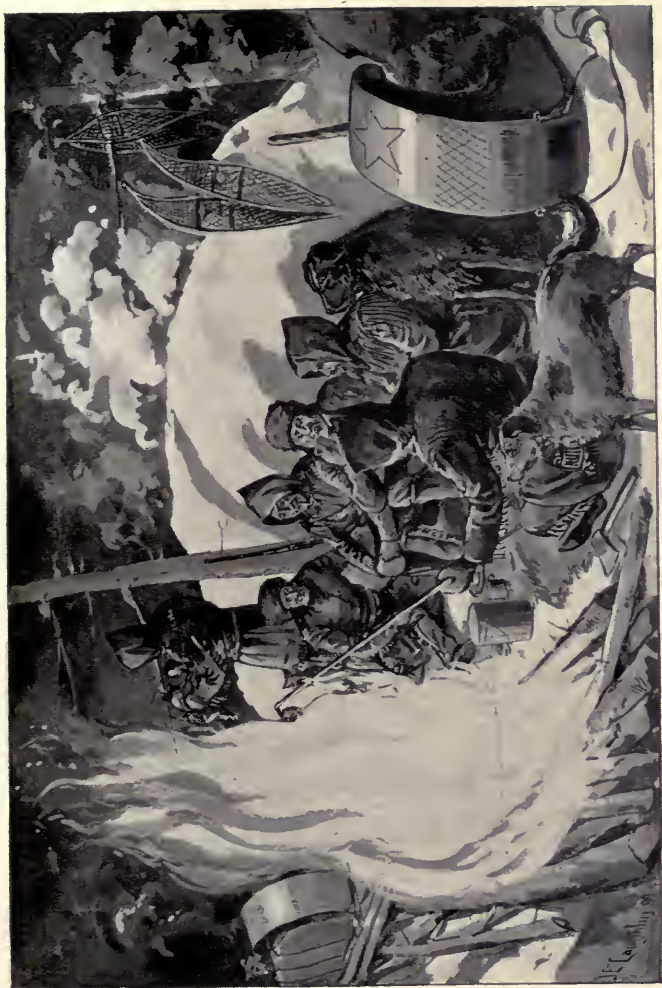
THE WINTER CAMP.